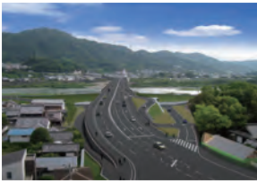
Prefectural road detailed design

These are the roads essential for daily transportations from automobiles to pedestrians. We are providing safe and simple designs that are readily applicable in accordance with the needs of the region.