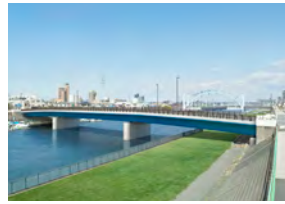
Bridge reserves / detail design

We select and design the most suitable methods from road structure reserves to the detailed design.