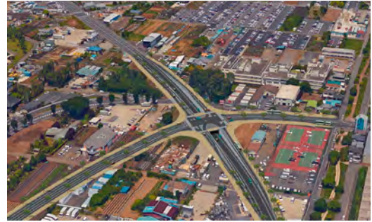
Overpass crossing design and surrounding facility design