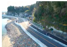
Slope collapse Slope measure design

Recognizing the importance of "road disaster prevention inspections," which can be said to be a health check for roads, we plan to propose and design measures not only for handling disasters but also for preventing disasters in advance.