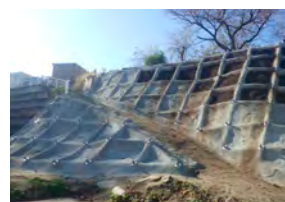
Rockfall guard fences

Recognizing the importance of "road disaster prevention inspections," which can be said to be a health check for roads, we plan to propose and design measures not only for handling disasters but also for preventing disasters in advance.