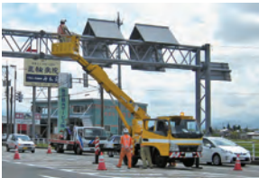
Road accessory inspection

For ancillary facilities, such as guard fences, signs, and lighting, we ensure adequate performance adhering to road standards, as well as consider maintenance and management while creating a stable and safe road environment for road users.