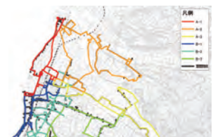
Setting an emergency inspection route (Sewage Business Continuity Planning)

BCP refers to the drafting of action plans to enable swift recovery of facility functionality (at the service level) in situations that there are restrictions such as damage to the water supply and sewage facilities or power outages after the occurrence of an earthquake. We provide total support ranging from the drafting of BCP to the provision of emergency response drills in accordance with the manual after their drafting.