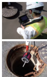
Inspection by pipe opening camera

It has become necessary to draft a stock management plan for all facilities owned by local governments from the perspective of life extension for each facility. We shall provide a survey / deterioration diagnosis for the purpose of maintaining the structural integrity of the sewage facilities, as well as drawing up facility life extension / stock management plans and proposing appropriate maintenance management / update plans.