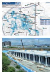
Inland hazard maps, Regulating reservoir design